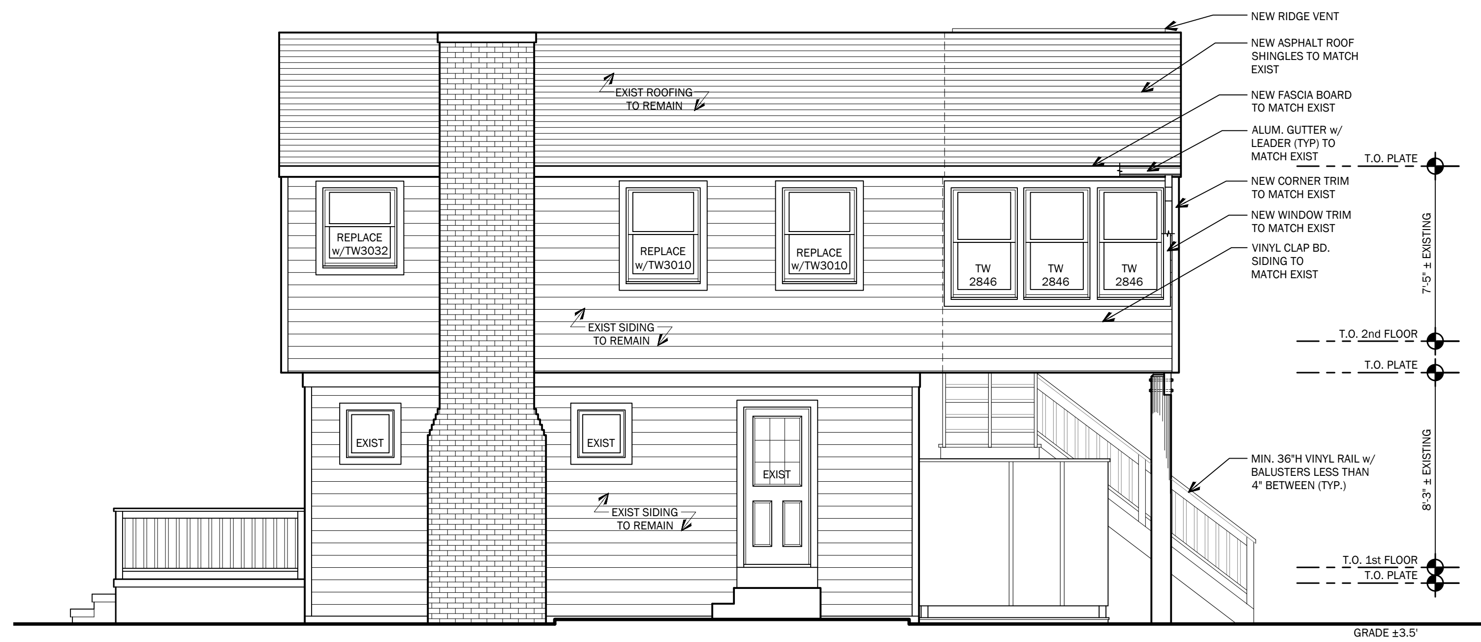
RIGHT SIDE ELEVATION (WEST SIDE)