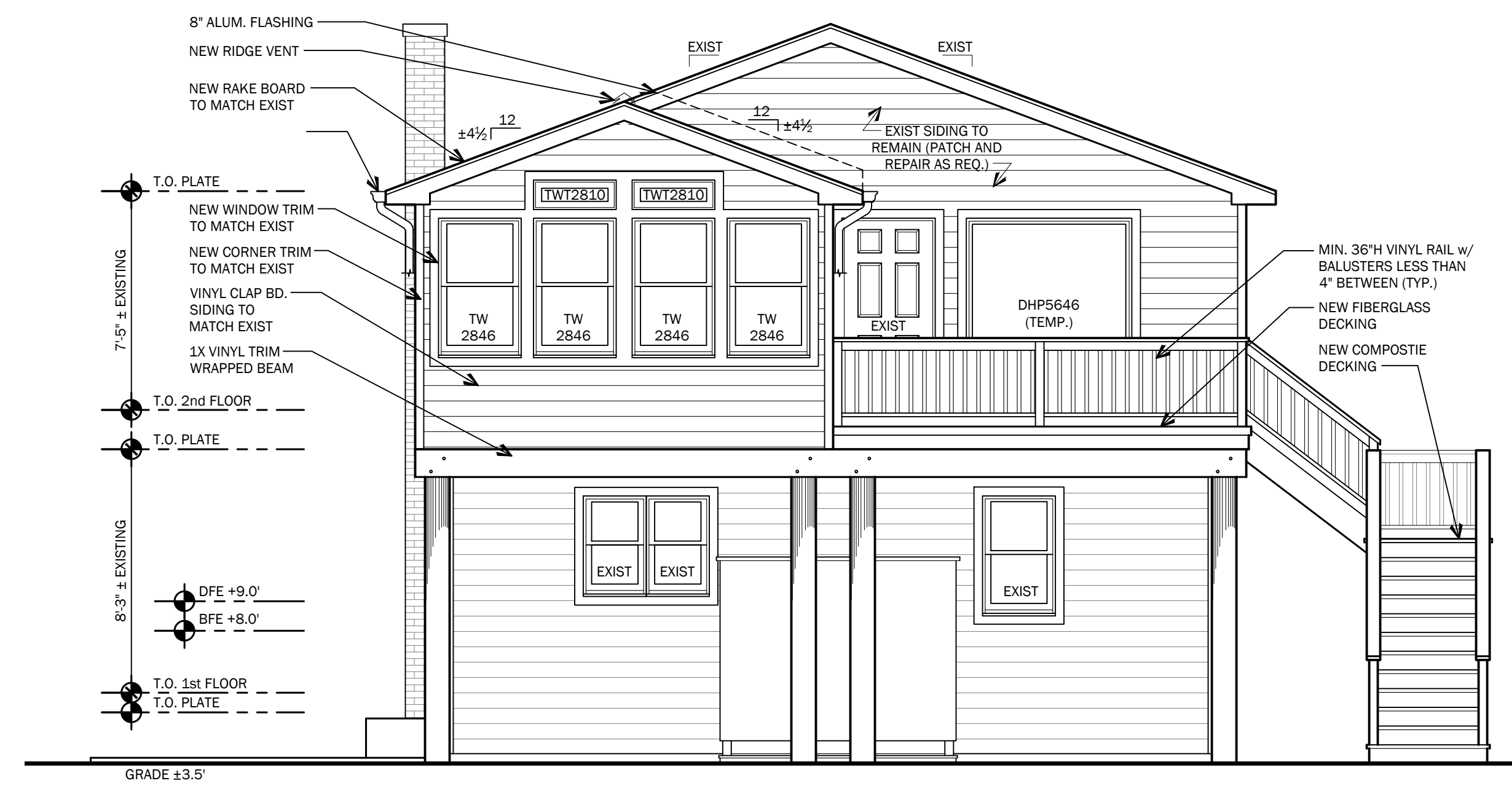
REAR ELEVATION (SOUTH SIDE)