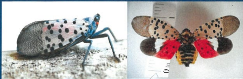
Adult Spotted Lanternfly, present in autumn months.

If you find any of these life stages of the Spotted Lanternfly, remove, devitalize, place in a sealed bag, and dispose of bag in the garbage.