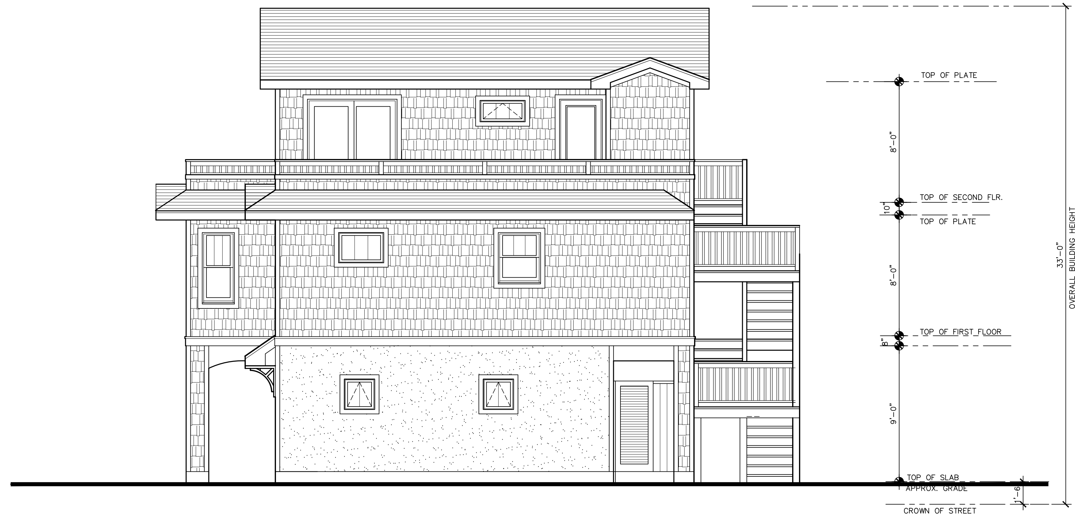
RIGHT SIDE/NORTH ELEVATION SCALE: 1/4"=1'-0"