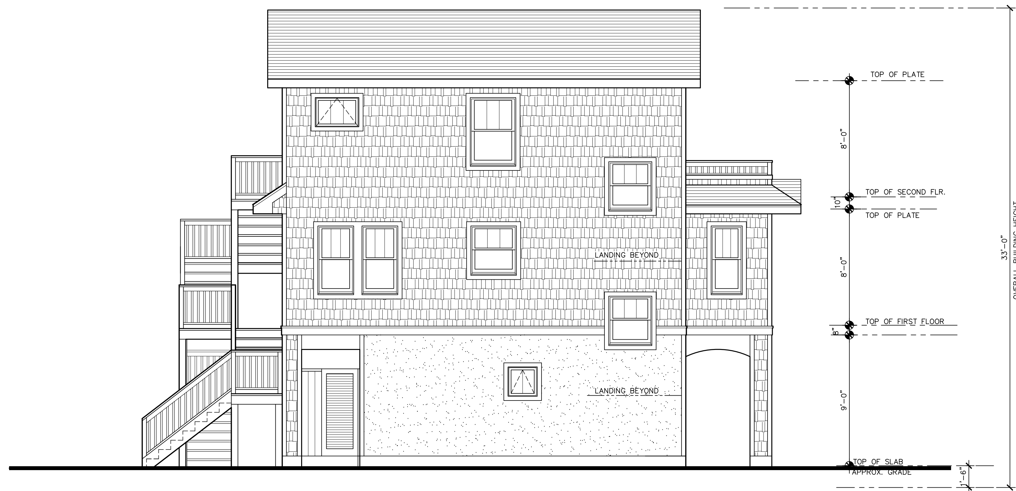
LEFT SIDE/SOUTH ELEVATION SCALE: 1/4"=1'-0"