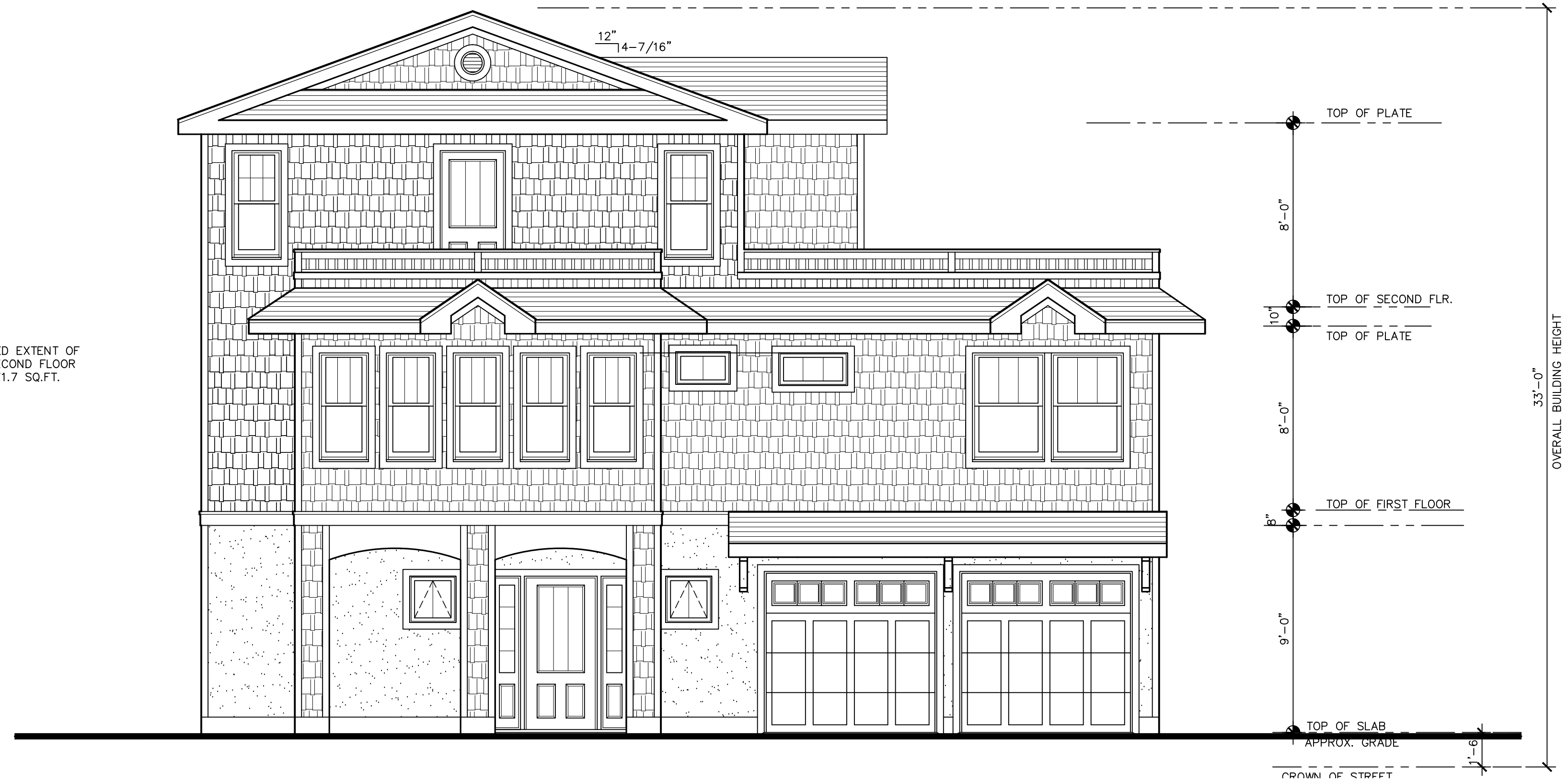
FRONT/EAST ELEVATION SCALE: 1/4"=1'-0"