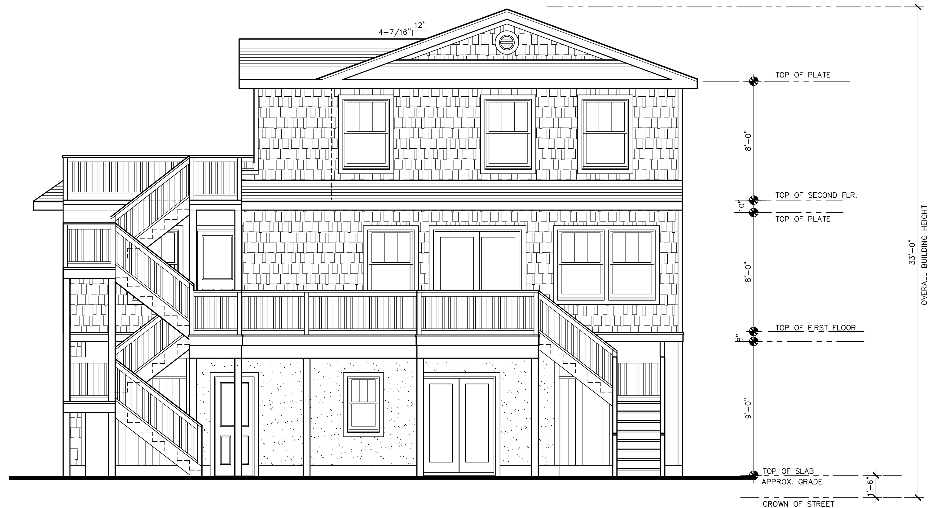
REAR/WEST ELEVATION SCALE: 1/4"=1'-0"